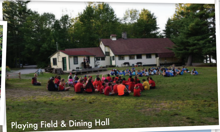
Playing Field & Dining Hall