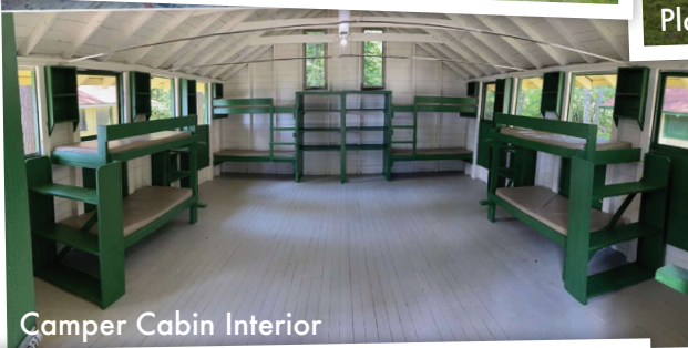
Camper Cabin Interior