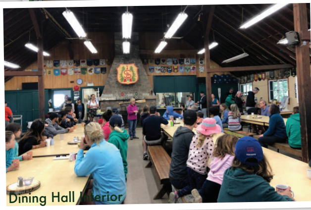
Dining Hall Interior