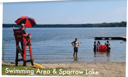
Swimming Area & Sparrow Lake